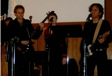
Messenger performs at Community Bible Church